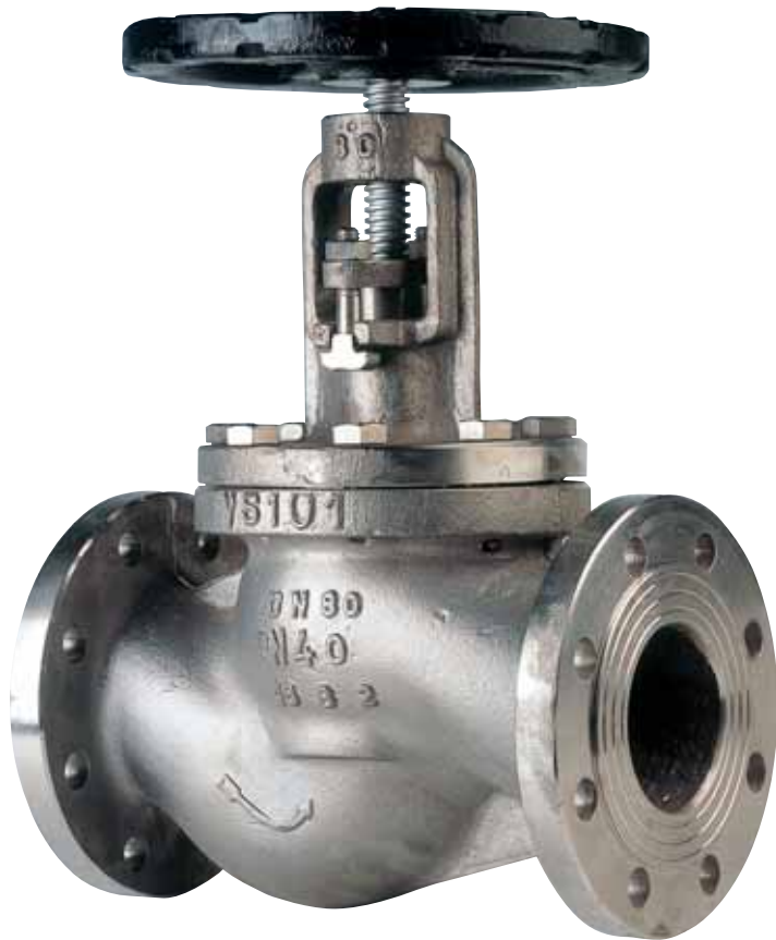
FIG. VS 101 SERIE PN-40